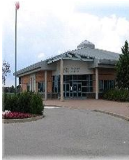
L'Amoreaux Community Centre, 2000 McNicoll Ave.

Another highly successful event held at L'Amoreaux Community Recreation Centre was the Asian Heritage Event. Once again the NWS LIP team helped by supporting outreach activities and connecting new and unique talent such as the Tamil cultural dance group to